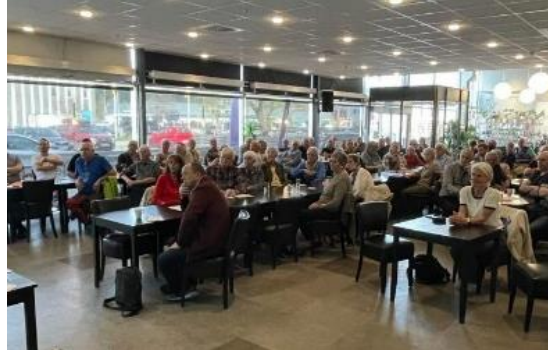
Lungekafè in Steinkjer

In collaboration with LHL (Norwegian patient advocacy group), we arranged three we-meetings for people living with chronic lung disease with the focus on awareness around COPD – symptoms.