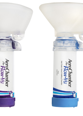
Adult Small mask